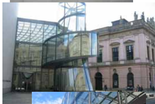
Deutsches Historisches Museum